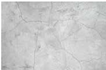
Fine Shrinkage Cracks